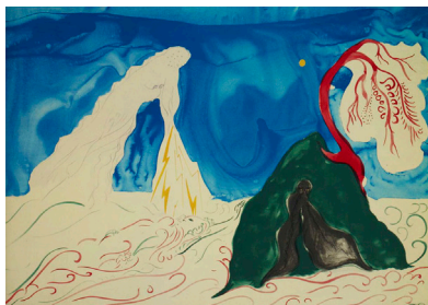
Paradise by Night