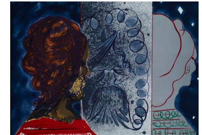
Paradise by Night (Rinse)