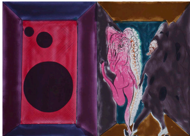
A Rave's Romance